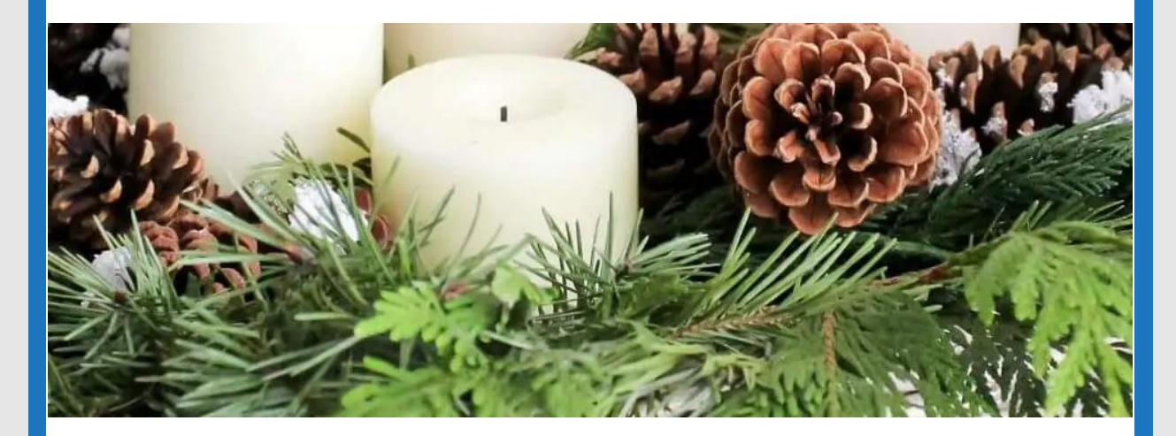
Please keep in mind our colleagues, friends and family who are ill, between jobs, or struggling in any way.